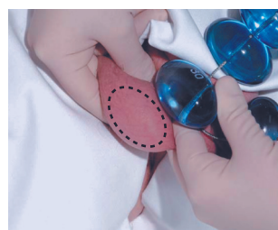
30 mL normal